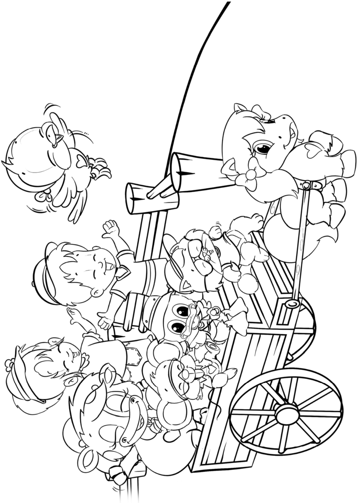
Unit 6: Colour the picture.