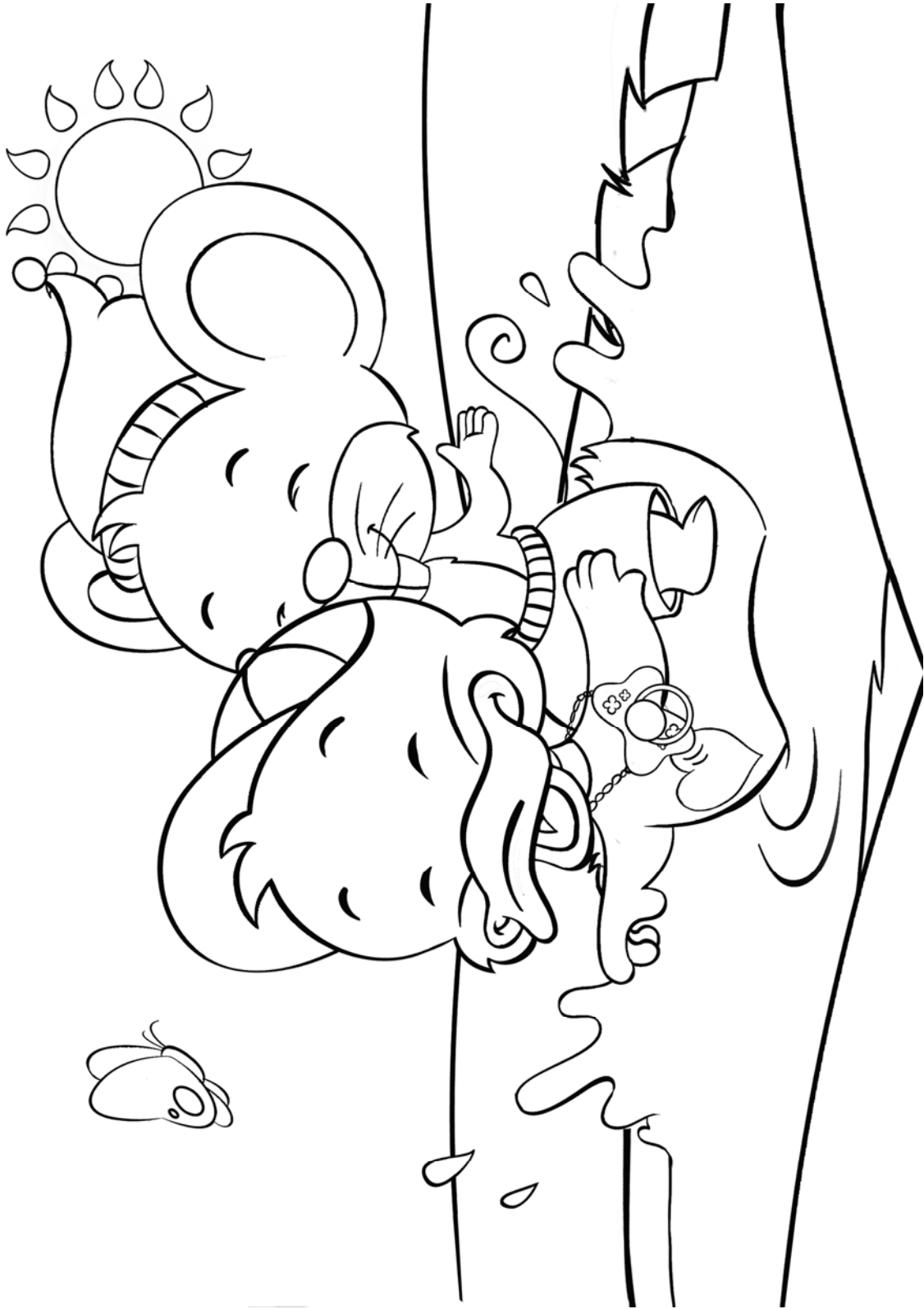
Unit 3: Colour the picture.